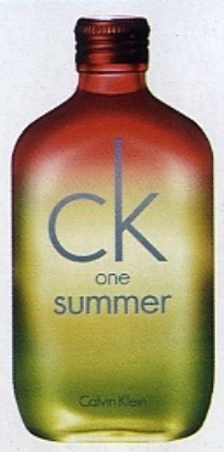
ck one summer, Calvin Klein.