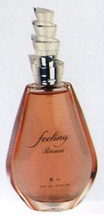
Feeling, Rasasi perfumes