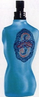
Summer Classique, Jean Paul Gaultier