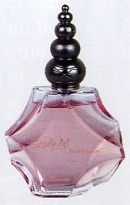
Beauty Art, Rasasi perfumes