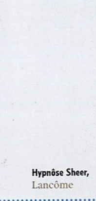
Hypnôse Sheer, Lancôme