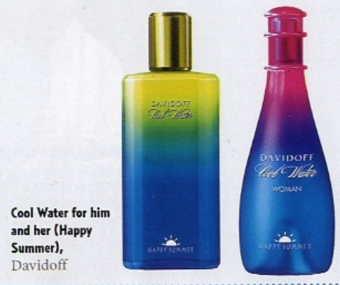
Cool Water for him and her (Happy Summer), Davidoff