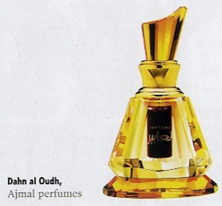
Dahn al Oudh, Ajmal perfumes