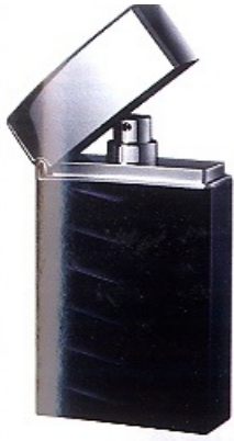
Tommy and Tommy Girl, Tommy Hilfiger